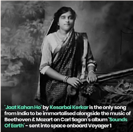
The better India